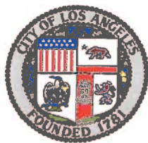
ERIC GARCETTI MAYOR